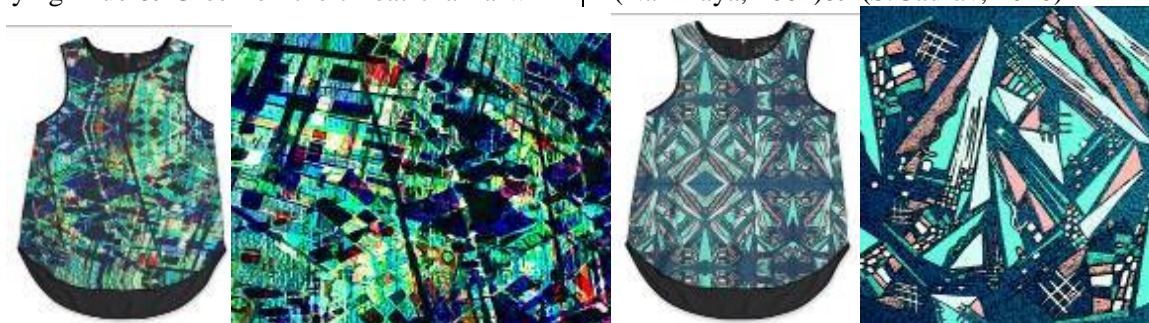
The Blue & Green designs with its implementation in fashion

affect lungs, and the lungs are associated with grief and sadness. Those cool colours providing relief from tension and evoke positive emotional responses. The blue colour will let us feel happiness & peace. While green the master of all colours will trigger stress reduction & balance. (Naz Kaya, 2004)& (S.Gaurav, 2010)