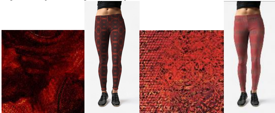
The Orange & violet designs with its implementation in fashion

force filling every part in our body. Also, violet is very important to be applied in the centre of the back of the knee which is linked with the kidneys and fear emotion. (Chiazzari.)