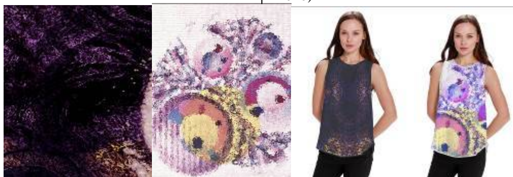
The Indigo designs with its implementation in fashion

So applying indigo on the spleen centre can purify this place and kill bacteria, then we have to apply yellow-orange over the solar plexus zone and blue on the lower back. (Chiazzari.) & (S.Gaurav, 2010)