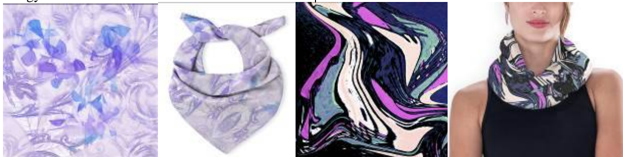
The Blue & violet designs with its implementation in fashion

affect us psychologically and physiologically in a specific manner. We will apply the colour irradiation technique to expose our body to different colours to activate different chakras and the related body organs and systems. So, in this research we did several designs based on the five organs, their related emotions and their resonate colours in healing, aiming not only to create satisfactory aesthetic designs but also to boost our energy level.