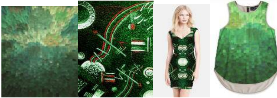
The Green designs with its implementation in fashion

achieving the required balance and bringing | calmness, and happiness to our wellbeing.