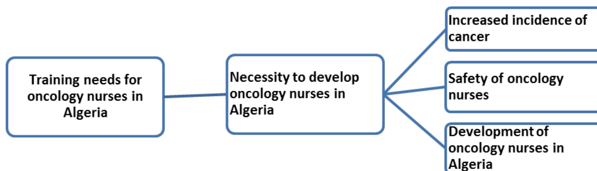
Figure 2: Training needs for oncology nurses in Algeria

All interviewees believe that there is a need to develop oncology nurses as displayed on figure 2.