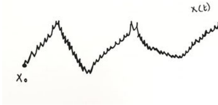
FIGURE 2.2: A SAMPLE PATH FOR A SOLUTION OF A STOCHASTIC DIFFERENTIAL EQUATION

Below is a graph of trajectory of the stochastic differential equation.