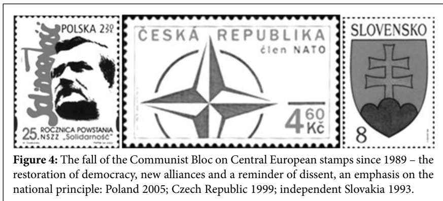
Figure 4: The fall of the Communist Bloc on Central European stamps since 1989 – the restoration of democracy, new alliances and a reminder of dissent, an emphasis on the national principle: Poland 2005; Czech Republic 1999; independent Slovakia 1993.

Postage stamps are a means of legitimisation for a country. They demonstrate to foreign countries and its own population which territories it controls. The Russians also used them in this way after they occupied the territory to the east of