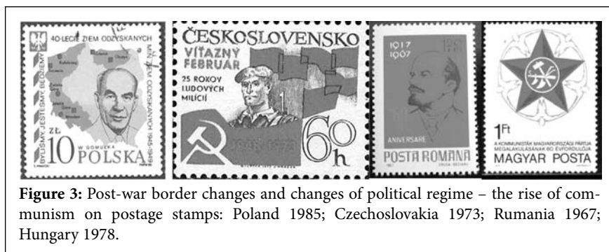
Figure 3: Post-war border changes and changes of political regime – the rise of communism on postage stamps: Poland 1985; Czechoslovakia 1973; Rumania 1967; Hungary 1978.

The influence of the liberation of Czechoslovakia by the Allied armies and the participation of volunteers in the resistance was immediately reflected in stamp form. Engravers and graphic designers produced designs of Czechoslovak state symbols, statesmen, military artefacts and war heroes from the foreign resistance. 10 The first anniversary of the May Uprising of 1945 was celebrated by the liberated state with a symbolic series with a sheet of stamps on which Saint George kills the dragon. 11