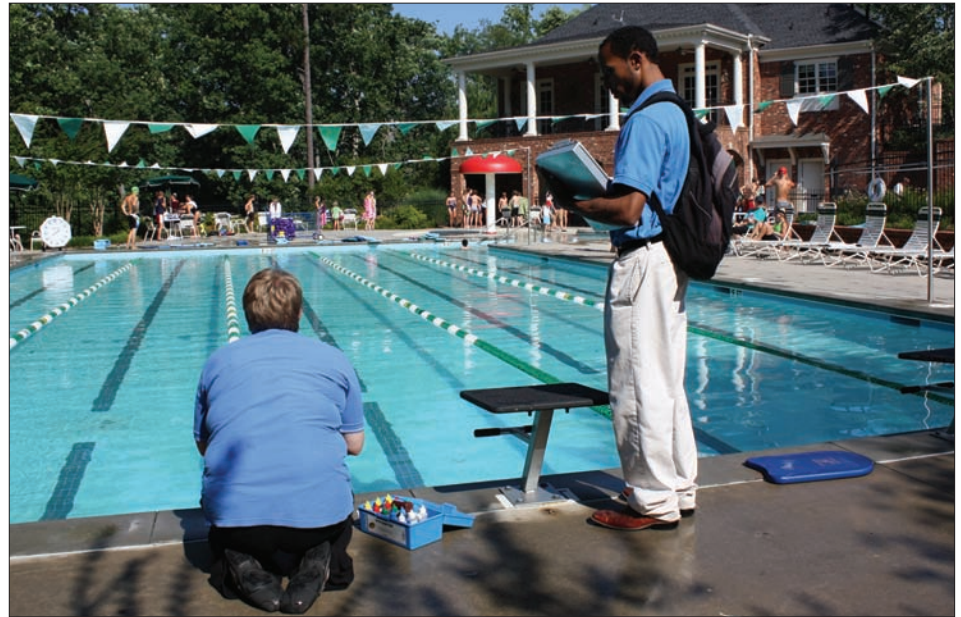
Environmental health professionals conduct an aquatic facility inspection.