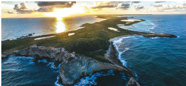
Commune of St. François, Guadeloupe.