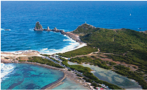
Figure 1: La Pointe des Châteaux : Poetic Beauty and Location