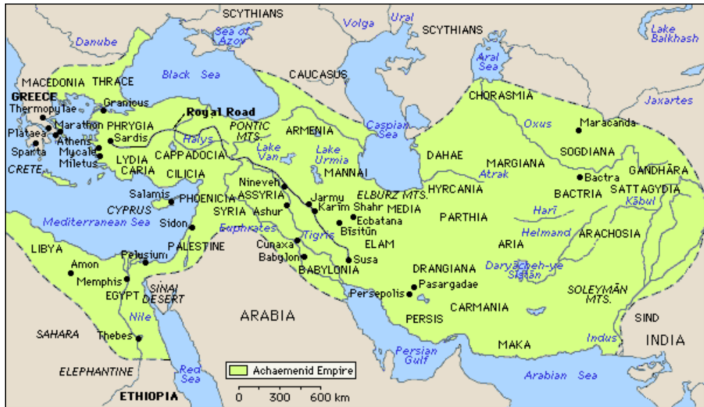
FIGURE 1. Achaemenid Empire, the first real world-empire of ancient history. 19

The royal house of Sasan also served as the custodian of the Fire Temple of Anahid at Istakhr. They established the Sasanian Empire, “claiming that they were the inheritors of the ancient kings and destined to revive their glory and reunite all peoples of Persia.” 18