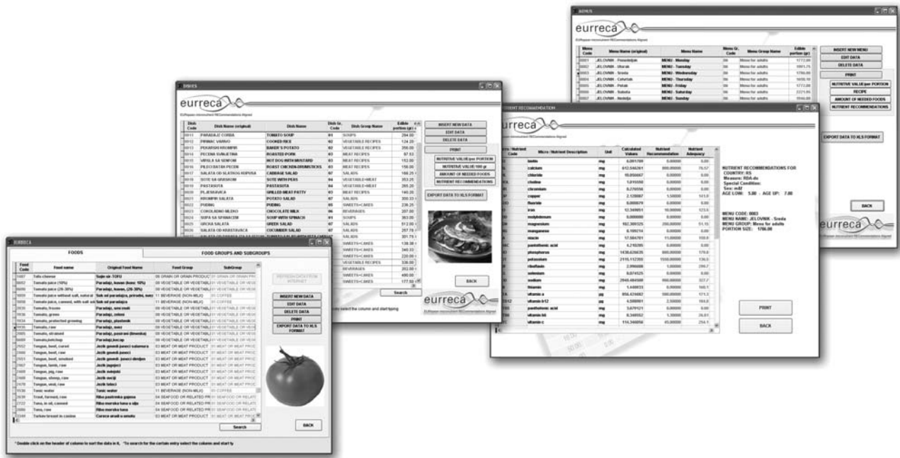
Figure 2 Screen prints of modules for foods, dish recipes and menus.

The second module is the calculation of dishes, meals and menus module (2) . The aim of this module is to calculate the nutrient composition of different dishes, meals and menus. The possibilities of the different submodules are listed below: