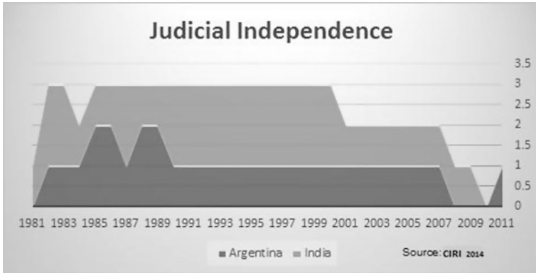
Fig. 3.1 Judicial independence in Argentina and India (Source CIRI Dataset, Cingranelli et al. 2014)

police and judicial custody appear in an annual report of NHRC. This directive has led to the creation of an archive on custodial deaths but not to the decline in the cases, as discussed below. The 1990s also saw the creation of a custodial jurisprudence on torture and custodial deaths that highlighted the continuing challenge for the judiciary of how to address the question of torture.