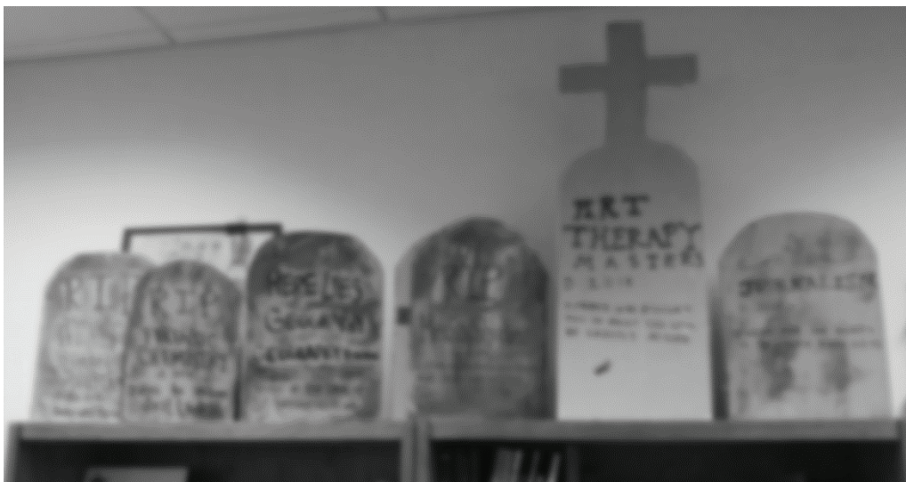
Figure 1: Gravestones memorializing programs suspended at LFSU on display in a conference room near writing faculty offices.

Following the memo, LFSU community members responded in a variety of ways. Participants and contemporaneous news articles mentioned acts of activism and clashes between faculty and administration. The graveyard was a notable example that Victoria shared with me and Miranda echoed. “I don’t necessarily love this imagery but some of the programs that did get suspended made like gravestones for themselves,” Victoria explained. Following our conversation, she brought me to a conference room down the hall from her office where the “gravestones” were displayed (figure 2).