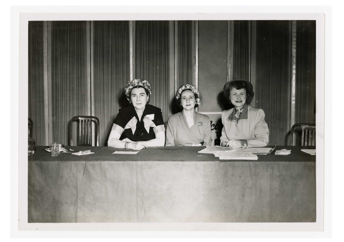
FIGURE 9 AWRT's First Officers

"A pioneer organization of women in the great American system of free broadcasting"<sup>377</sup>